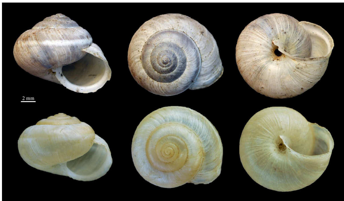
FIG. 1. Shells of Harmozica ravergiensis from Gvozdiv village in Kyiv region.

РИС. 1. Раковины Harmozica ravergiensis из с. Гвоздов Киевской области.